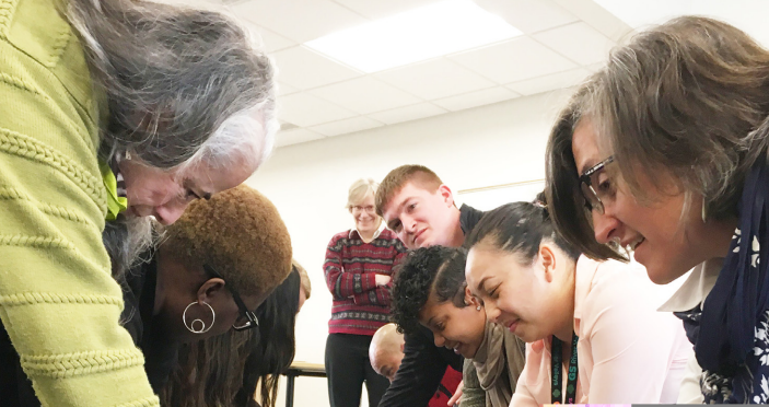
Sprockets Initiative & Problem Solving Training