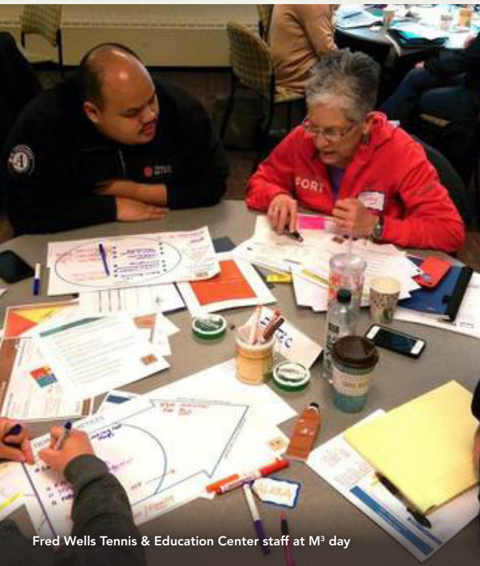
Fred Wells Tennis & Education Center staff at M 3 day

of participants learned concepts and techniques at Sprockets trainings that will help them in their work.