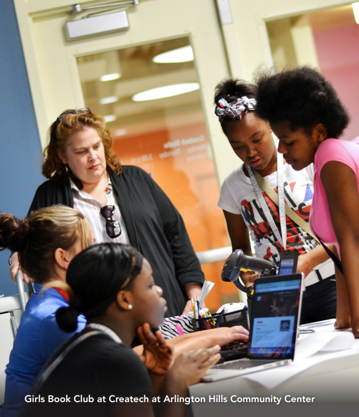
Girls Book Club at Createch at Arlington Hills Community Center

In 2016-2017, 32 organizations started the Activator Cycle. Nearly all of those organizations (30) were able to attend the quality kick-off, collect data, make improvement plans with their staff, and carry out improvements – completing the Activator Cycle. That's 30 organizations committed and equipped to intentionally improve their programs so they have bigger impacts on the youth they serve.