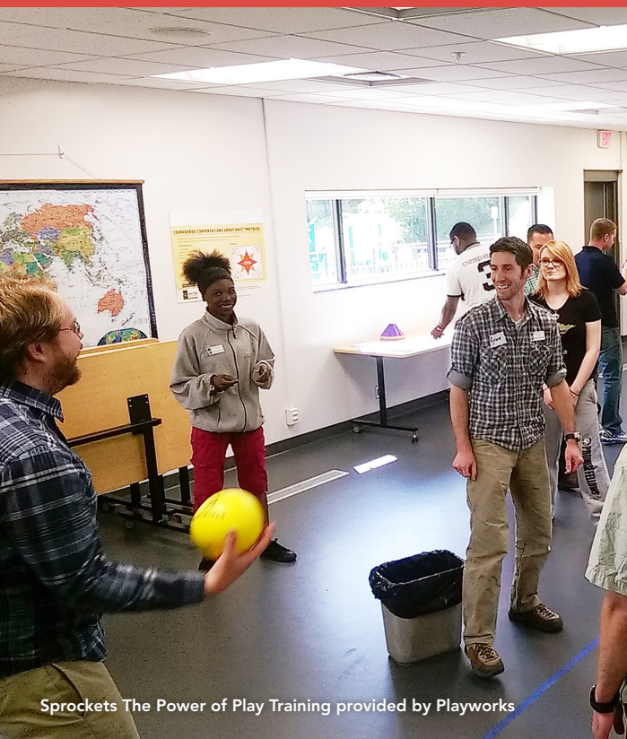
Sprockets The Power of Play Training provided by Playworks

Our mission: Sprockets improves the quality, availability, and effectiveness of out-of-school time learning for all youth in Saint Paul through the committed, collaborative, and innovative efforts of community organizations, government, schools, and other partners.